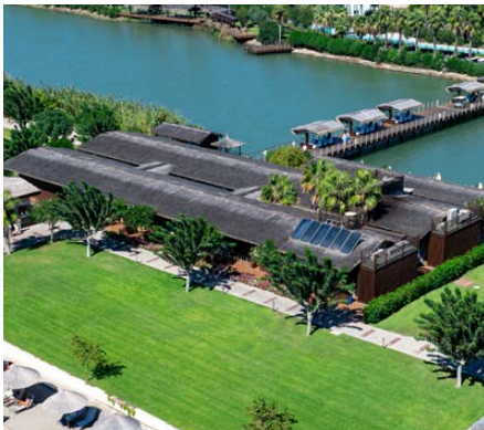
Gloria Serenity Resort Traces Green Area 1000 m 2