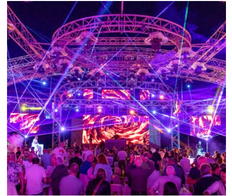
Gloria Hotels & Resort G-Venture 1000 m 2