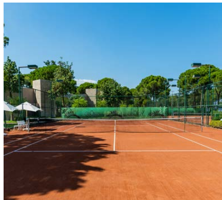
Gloria Serenity Resort Tennis Courts 3x Courts, Per Court 800 m 2