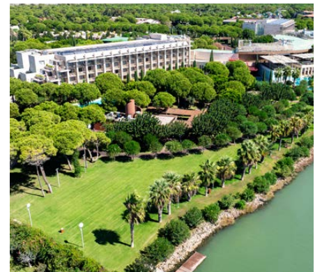
Gloria Serenity Resort Italian Green Area 2000 m 2