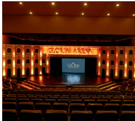
Gloria Hotels & Resort Amphitheater 1156 Leather Seat