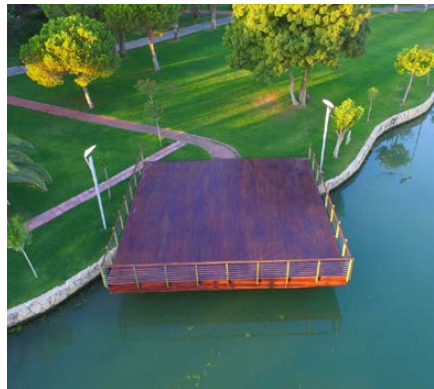
Gloria Golf Resort Deck 130 m 2