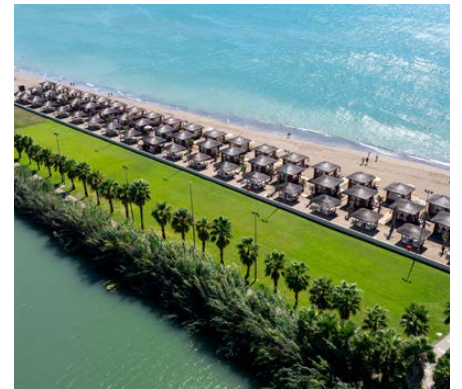
Gloria Golf Resort Secret Garden Green Area 4000 m 2