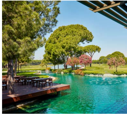
Gloria Golf Club Terrace 700 m 2