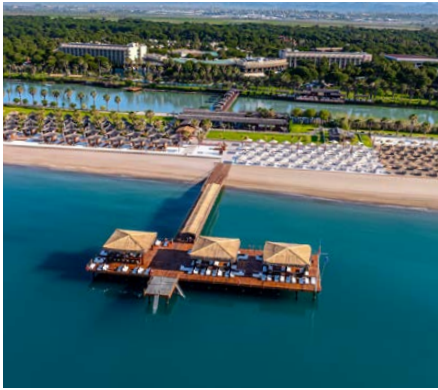
Gloria Serenity Resort Beach 750 m