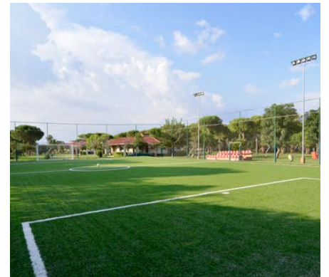
Gloria Golf Resort Football Field 1200 m 2