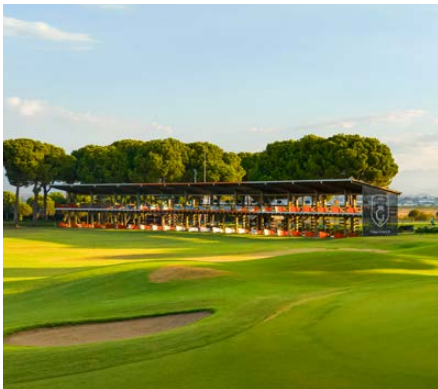
Gloria Golf Club Driving Range 30.000 m 2