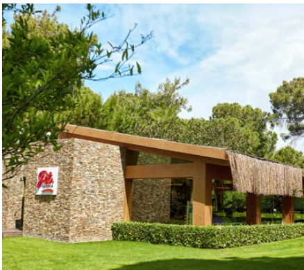
Gloria Verde Resort Wellnes Green Area 300 m 2